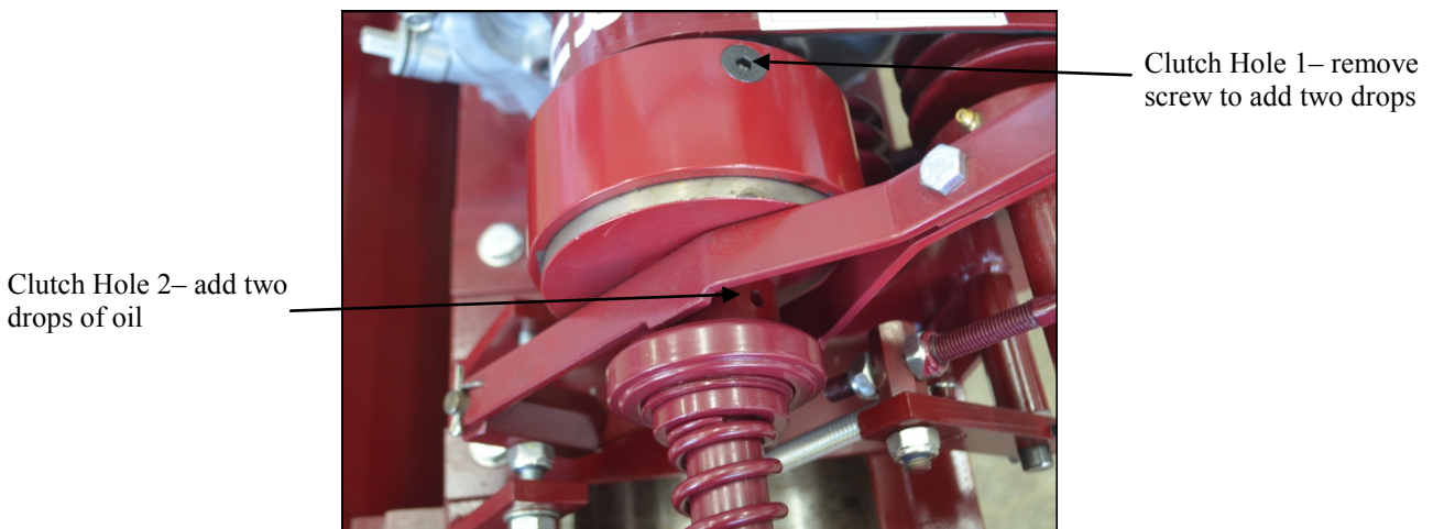
Figure 2: Clutch